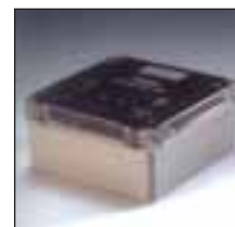
Typical Examples of IP 65 enclosures