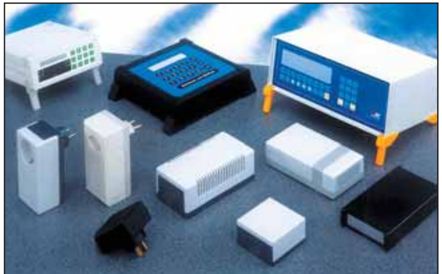
Enclosures for electronic applications