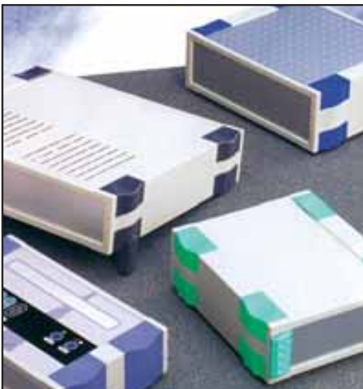
Boteago - desktop wall mounting enclosure in snap on no screw configuration