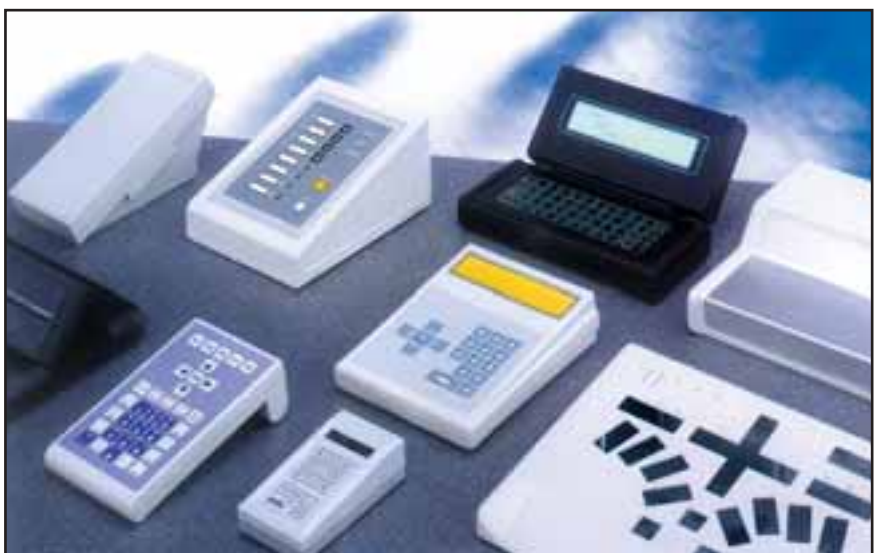
Console type enclosures for electronic applications