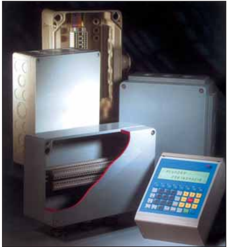
IP 65 enclosures in Aluminium

This programme overview is designed to give you some idea of what is on offer from Phoenix Mecano, and will help you locate just the right needs from our extensive selection.