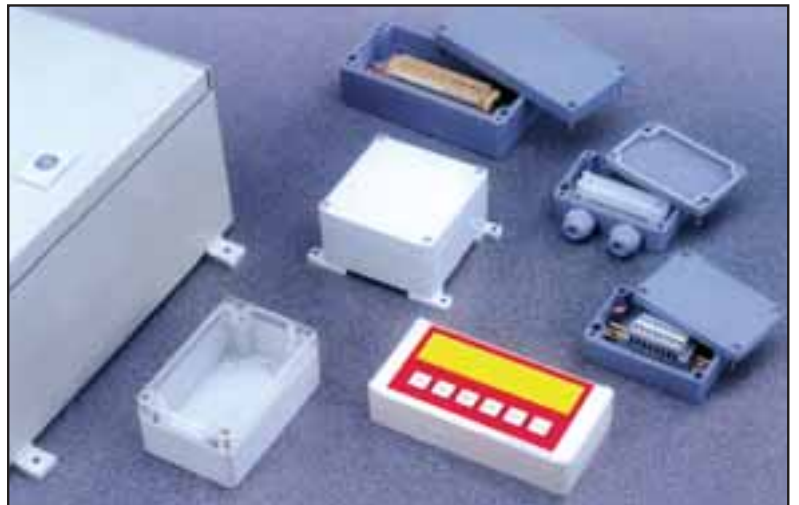
IP 65 enclosures in Polyester / ABS / PC